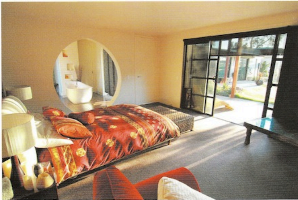
The master suite (above) was an important feature in this home. Three key elements emerged from this room, with the link back to water, the direct relationship between indoor/outdoor areas, and the open plan formula.