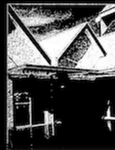
Building Design of the Year Tantaro Design